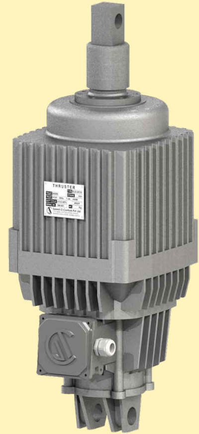
ELECTRO-HYDRAULIC THRUSTER MODEL ELDY 201/06