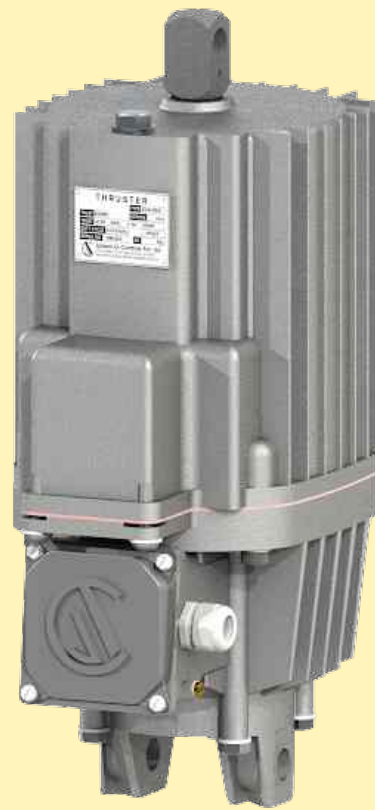
ELECTRO-HYDRAULIC THRUSTER MODEL ELDY 80/06