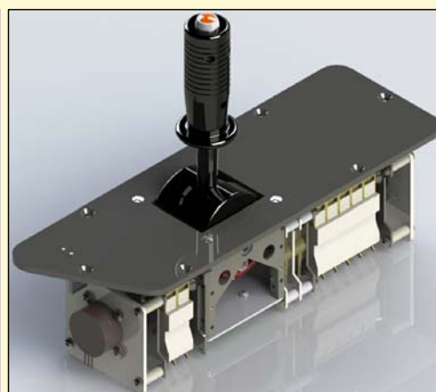
Directional switch signal closed Position