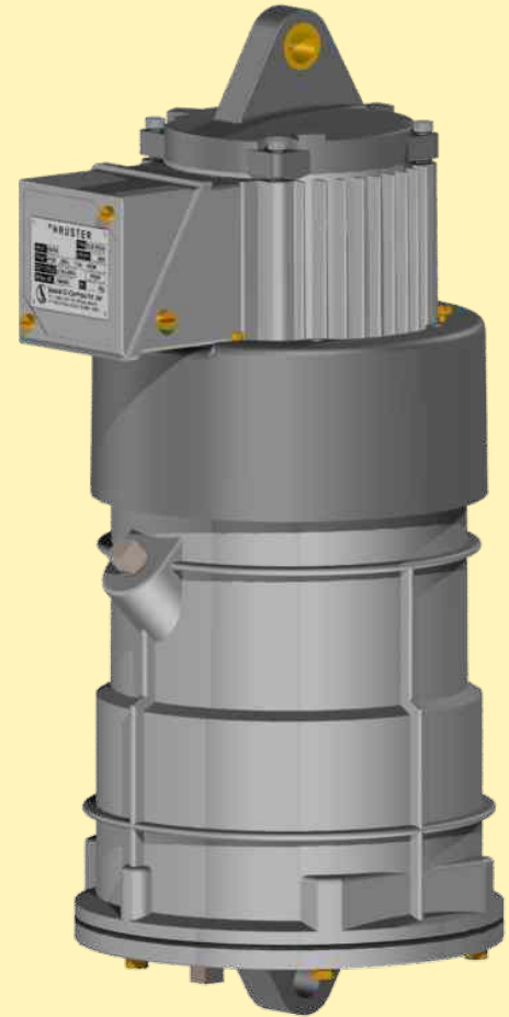
ELECTRO-HYDRAULIC THRUSTER MODEL ST 520