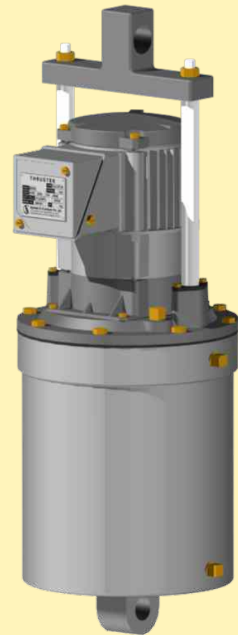
ELECTRO-HYDRAULIC THRUSTER MODEL ST 545