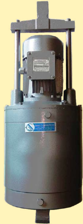
ELECTRO-HYDRAULIC THRUSTER MODEL ST 13300